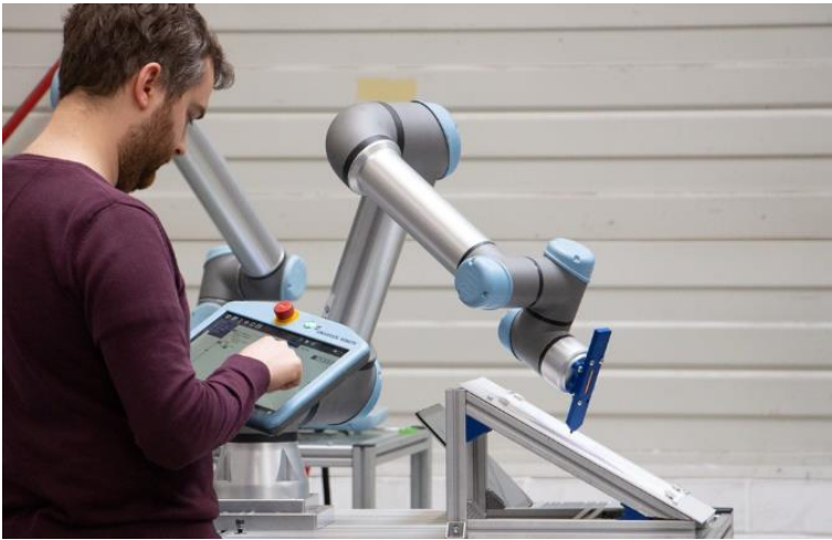
Cobots are collaborative robots that can work directly with humans to support them.